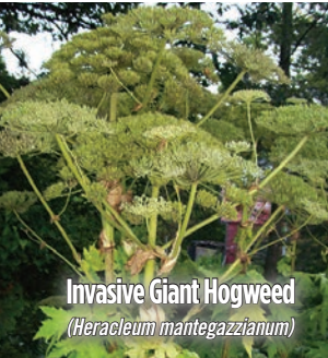
Invasive Giant Hogweed ( Heracleum mantegazzianum )