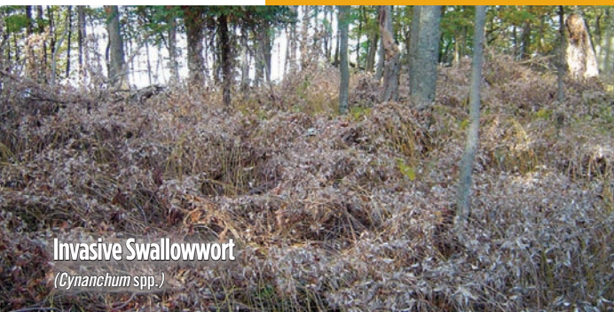
Invasive Swallowwort ( Cynanchum spp.)

SCIENTISTS ESTIMATE that invasive plants cost our economy $35 billion in damages and treatment each year.